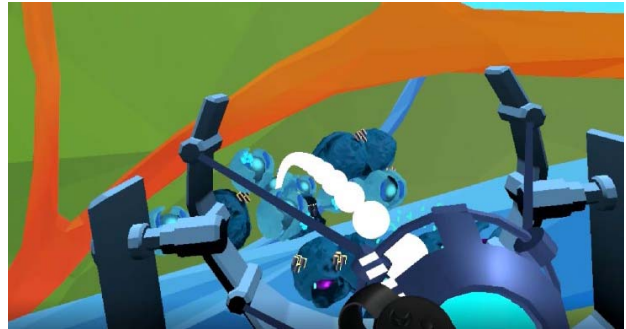
Figure 3. The slingshot 3DUI for vaccine delivery

After the APC cells are successfully identified and labelled, the user needs to deliver the vaccine particles directly to the APCs. To make the delivery a more playful experience, we integrated a 3D UI resembling a slingshot in the nanobot. The slingshot can be activated by pressing a button on the controller. Users can pull the controller to drag the slingshot and shoot the vaccine particles at the identified APCs. The predicted trajectory is visualized in front of the slingshot to help users target the right location.