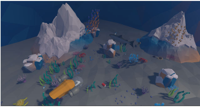
Figure 2: The player uses an experimental submarine's pollutant extracting equipment to clean the trash from the ocean.

wastes polluting the ocean. These mutations have caused certain deep-sea creatures to grow exponentially in size, leading to reports of their aggressive behaviors toward other marine life and investigating parties. Studies have shown that removing particular contaminants will cause insufficient nutritional intake for these creatures and lead to their extinction, preventing their potential long-term food chain effects. The user is cast as a senior marine biologist leveraging an experimental submarine built to withstand these mutant creature threats and equipped to collect large amounts of plastic waste from the ocean (Fig. 2).